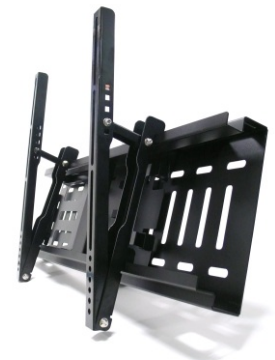
■ Adjustable display angle : 0~ 15 degree